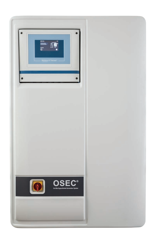
OSEC L System