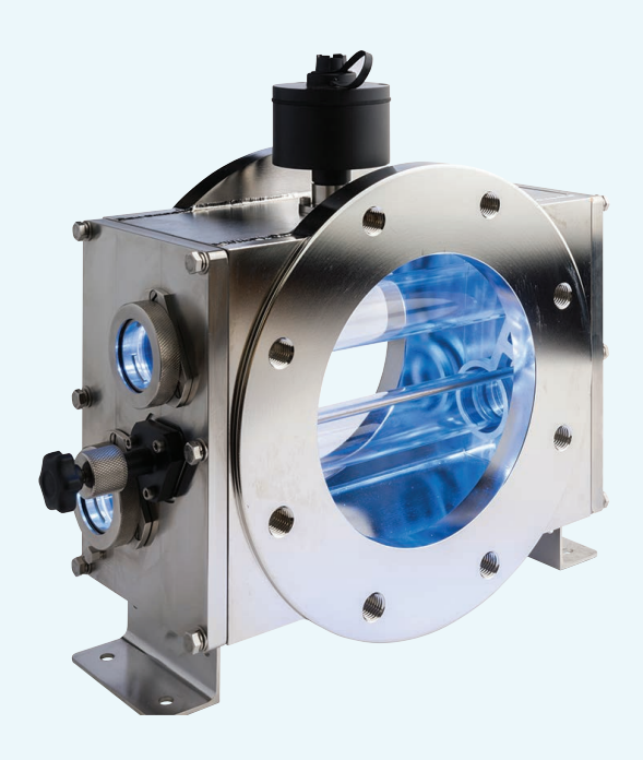
Ultra-Compact WAFER® UV System