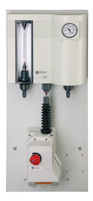
V10K™ Vacuum Gas Feed System

Gas Chlorination is one of the most economic disinfectants available as gaseous or liquid chlorine supplied in cylinders or ton containers. Using a remote vacuum operated gas feeder, a chlorine solution is prepared on site from chlorine gas and water. Evoqua offers the V10K™ vacuum gas feeder featuring the proven V-notch flow control technology for safe and accurate dosing and control of gaseous chlorine, including other disinfectants such as ammonia and sulphur dioxide.