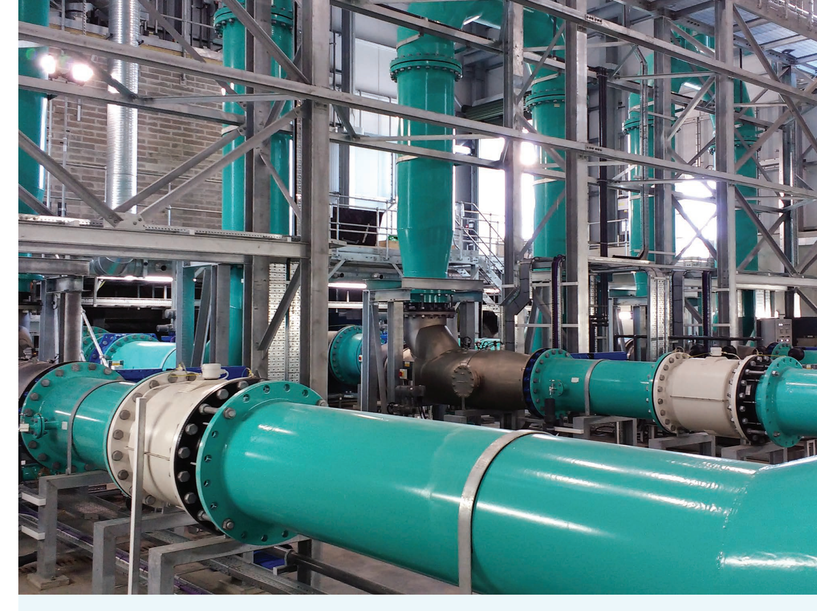
UVLX-30800-30 low pressure amalgam system in situ operating at a UK drinking water plant