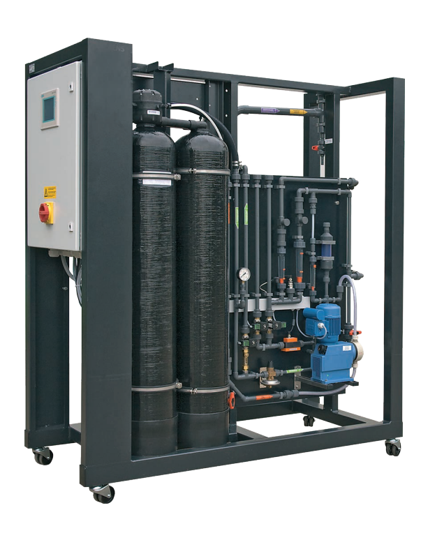
OSEC B-PAK System