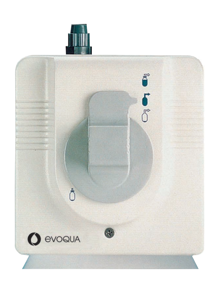
S10K™ Vacuum Regulator