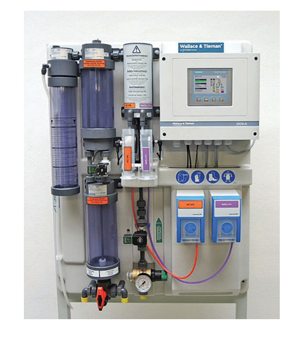
DIOX-A Chlorine Dioxide Generator

Evoqua's DIOX range produce a high quality, chlorine dioxide solution that will improve efficiencies and drastically reduce the chance of a bacterial outbreak. Effective as both a disinfectant and oxidizing agent, it is also ideal for the control of biofilm and zebra mussel control within inlet systems.