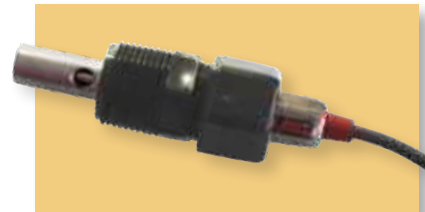
Assembled Conductivity Sensor

The CS51 is ideal for general purpose use up to 20,000 µS/ppm.